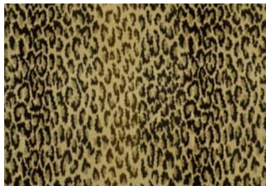
Rock Leopard | Snow Leopard

Penelope Anne is a cotton and wool appliqué whose natural elegance speaks to the extraordinary amount of time, effort, skill, and craftsmanship that goes into its creation. The ground fabric is woven, scoured, washed, dyed, finished and ironed in South India. Once completed, it travels 1,000 miles to North India where each area of the appliqué is individually added, including hand-embroidered French knots and rice stitches. With a process that takes months to complete, it is apparent why Penelope Anne possesses such a natural beauty and true, crafted elegance.