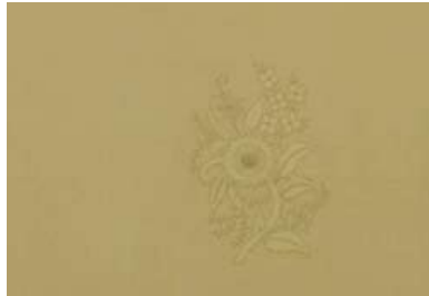
Penelope Anne | Antique

Penelope Anne is a cotton and wool appliqué whose natural elegance speaks to the extraordinary amount of time, effort, skill, and craftsmanship that goes into its creation. The ground fabric is woven, scoured, washed, dyed, finished and ironed in South India. Once completed, it travels 1,000 miles to North India where each area of the appliqué is individually added, including hand-embroidered French knots and rice stitches. With a process that takes months to complete, it is apparent why Penelope Anne possesses such a natural beauty and true, crafted elegance.