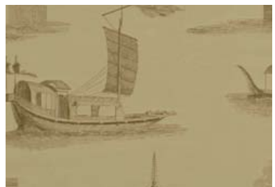
Dragon Boat | Light Taupe

One of the most timeless and beautiful forms of inspiration comes from the celebration of cultural craftsmanship and folklore. Matte Raffia and Modern Art follow in the footsteps of Beacon Hill patterns Quarry Hill and Chironomy, while Dragon Boat engages in story-telling like Beacon Hill's toile, Natsuko.