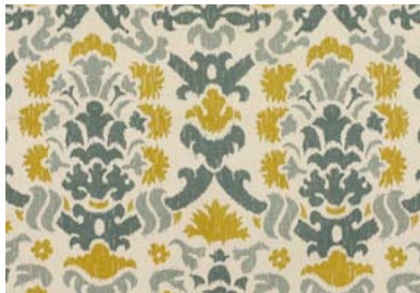
Matte Fleur | Blue Smoke