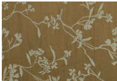
Thale Cress | Light Taupe

As its name suggests, Rock Leopard is based on a 1960's archive piece, originally inspired by the spotted dense coat of the African leopard. Using the finest cotton and linen fibers, the natural striations of the leopard coat are recreated using yarns that are hand placed and then knotted into the weaving loom. These linen yarns are grown, harvested, spun and dyed in the north of France to insure the finest quality of linen. Even the looms themselves were transported overseas from France in order to preserve the traditional methods and unique quality of this American-made fabric. Although they are state of the art technology, the looms still recreate the old world style of weaving, requiring an extraordinary amount of time and complex craftsmanship to perfect. The result is a gorgeous velvet that will last for decades on a piece of furniture.