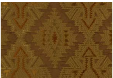
Modern Art | Rust