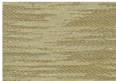
Water Meadow | Linen