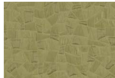
Craquelure | Ming Green

The transitional designs in this collection speak a natural and organic language. Inspired by a tortoise shell mosaic, Craquelure shares its roots with Beacon Hill patterns Bacharach and Royal Glimmer; while Water Meadow takes on the same flowing characteristics as Silk Ripple.