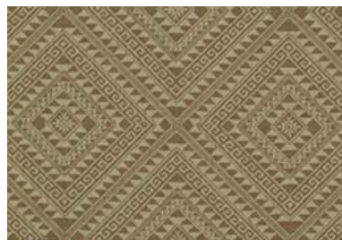
Matte Raffia | Flax