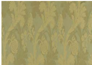
Tree Blooms | Jade