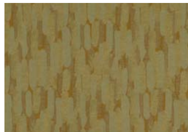
Canyon Rivers | Patina Rust