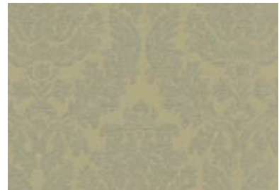
Shepards Purse | Ice

The ikat effect in Matte Fleur gives the traditional frame a modern twist, while Tree Blooms is a beautiful interpretation of a classical garland design. These designs follow the lineage of patterns like Cosenza, Chenille Damask, and Yala.